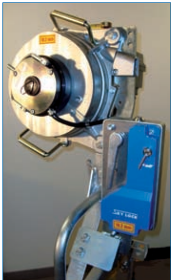
Alpha 1000 with stirrup mounted Sky Lock (recommended)