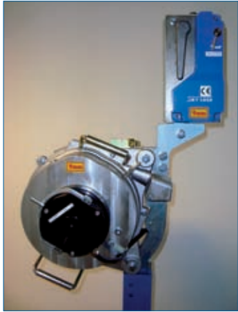
Alpha with hoist mounted Sky Lock